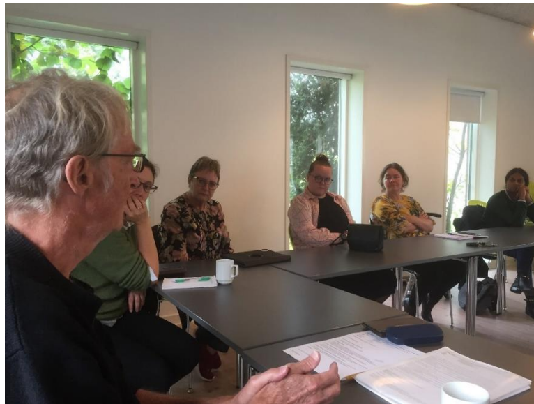
MP Breakfast/Lunch meeting

The main goal is to help the users take leadership / control of the project. If they do not have the surplus of energy to do this, we have established a sustainable relationship with UCSYD. This means, we have the finances and support to continue the Hear Me Out project in the future.